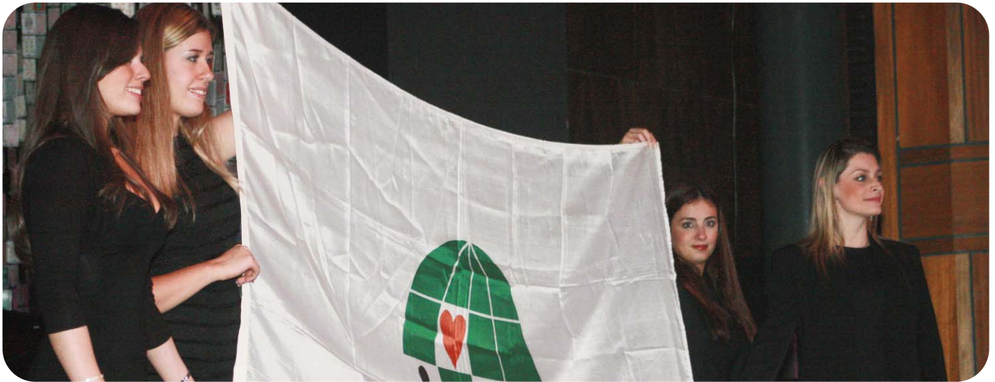
The World Bridge Federation flag on display at the opening ceremony