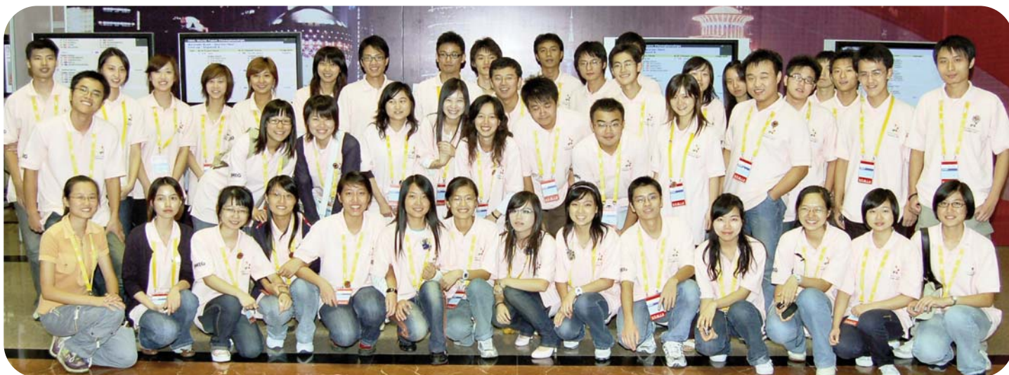
Some of the 54 volunteers from the Shanghai International Studies University.

There will be a new Bermuda Bowl champion in 2007. A team from South Africa that barely qualified for the quarter-final round pulled one of the biggest upsets in the history of the event on Monday, defeating the powerful Italian team 184.7-167.