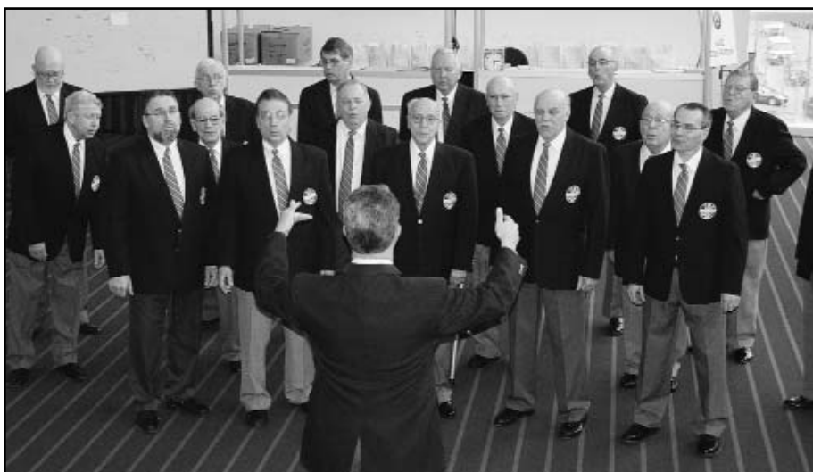
The Harmony Line Chorus, an a capella choir, entertains players between sessions on Thursday. Members of the barbershop choir took turns as director.

Through the evening session on Thursday, the table count at the 2005 Spring NABC was at 7055.5 with three days to go and the North American Pairs coming to town.