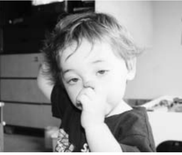
"I can make it if trumps are 3–3 and the king is onside." A future player poses for the camera at the NABC child care.