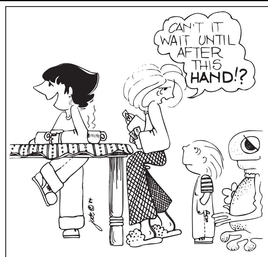
Cartoons Jude Goodwin, from the book Go Ahead Laugh, published by Master Point Press.

Play commentary: As South, in order to avoid the club finesse, you must try to set up at least one of dummy's hearts for a club discard. When setting up a long suit in dummy, keep as many late entries to dummy as possible. Win the \mathbf{A} K and play the \mathbf{A} A and \mathbf{A} K, East discarding a club or a diamond. Notice that the A and the