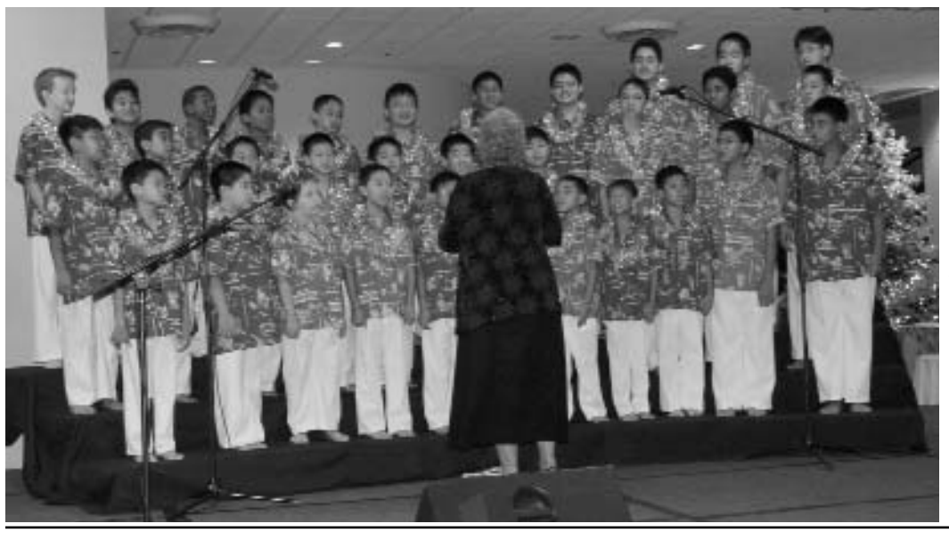
The Boy Choir of Honolulu performed yesterday between sessions.