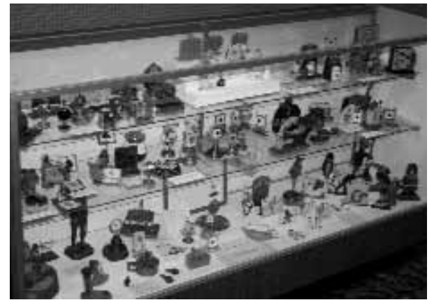
Some of the dozens of trump indicators on display in the Marriott.