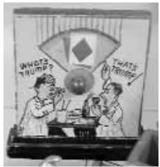
Two of the many colorful trump indicators on display at the Boston NABC.

the ACBL to help launch the organization's new Foundation for the Preservation and Advancement of Bridge. The foundation's mission includes collecting Continued on page 6