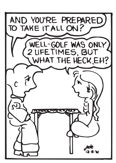
Cartoons Jude Goodwin, from the book Go Ahead, Laugh, published by Master Point Press.

overtrick or two. An optimist sees the glass half full, a pessimist sees it half empty, and a bridge player playing teams sees it cracked with water running out the bottom. Expect the worst and play safe to make the contract. If you lose by 1 IMP, don't call me.