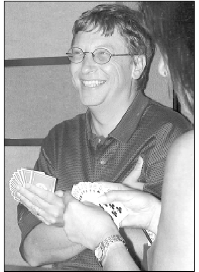
Microsoft chairman and bridge enthusiast Bill Gates