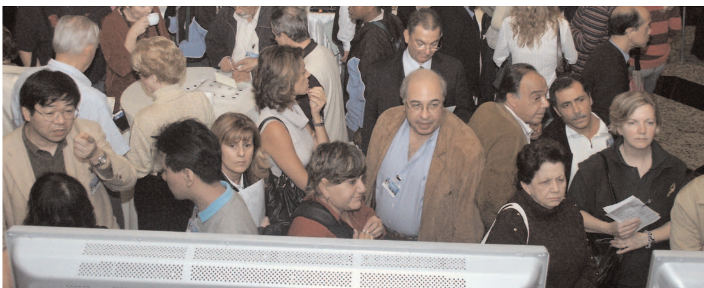
Players in the Transnational Mixed Teams check their scores on the monitors

After 11 days of play, the finals are set for the Open and Women's series of the World Bridge Olympiad as Italy, the Netherlands, Russia and the USA prepare their opening shots today.