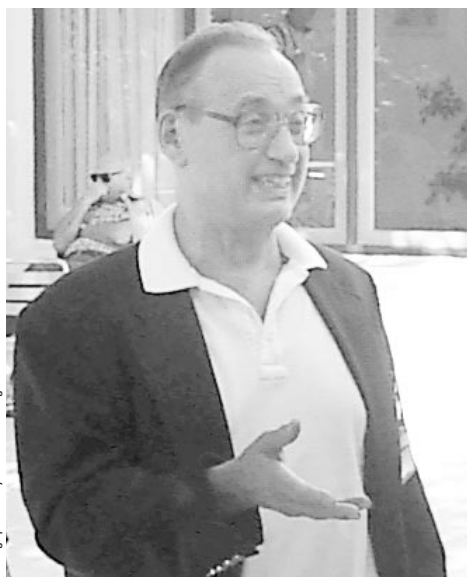
Photograph courtesy of Kodak's new digital camera