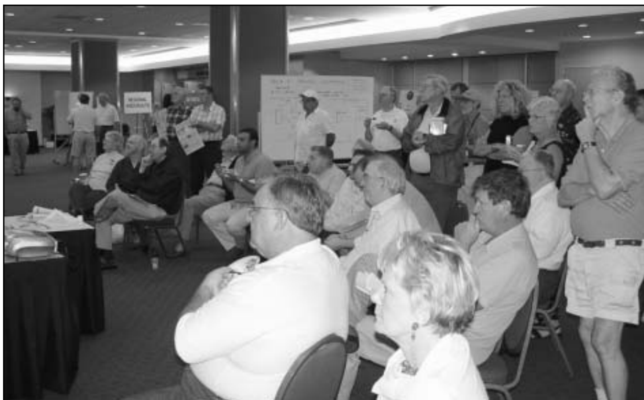
A crowd gathered Friday morning for the start of the final of the Wagar Women's Knockout Teams. Bid-bid and play-play in both rooms could be seen simultaneously on the screen at the hotel's exhibit level thanks to a broadcast by Bridge Base Online. BBO will also broadcast the semifinal round of the Spingold Knockout Teams today – both matches – and the final on Sunday.