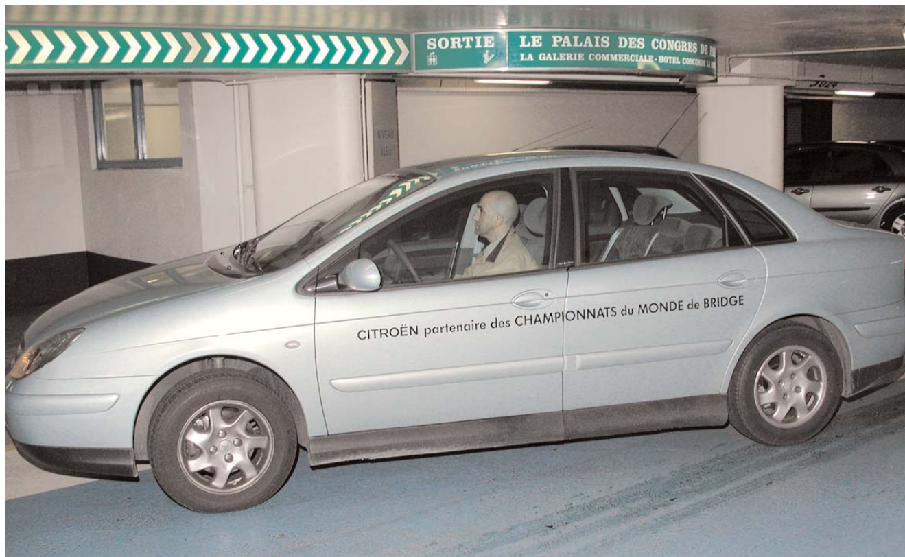
Citroën, Partner of the World Bridge Championships

The story of the self-sacrifice of Captain Titus Oates during Scott's doomed expedition to the South Pole is well known. Hoping to give his comrades a better chance of survival Oates walked out of the tent into a blizzard in the hope of saving those more physically fit, with the immortal words, 'I'm going outside and I may be some time'. We have a theory in the Daily News that what he actually said was 'I'm going outside. Don't move the tent'.