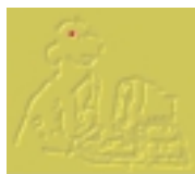
Bridge Player Live

For all those who wish to continue their vacation and also have a lot of fun, the OPAF Greek Bridge Club, in collaboration with Bridge Player Live Internet club has organised a three-day tournament in Maleme, which is about 30km away from the airport of Chania in Crete, Greece.