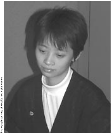
Photograph courtesy of Kodak's new digital camera.