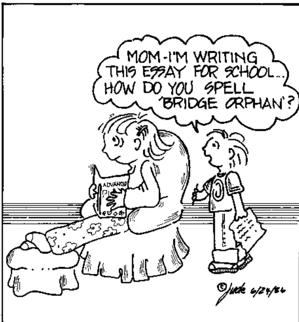
Cartoon by Jude Goodwin

Swiss Teams: an event in which a team (of four, five or six players — with four playing at a time) plays other teams in seven-, eight- or nine-board matches. Team A sits North-South at Table 1 and East-West at Table 2 while Team B sits East-West at Table 1 and North-South at Table 2.