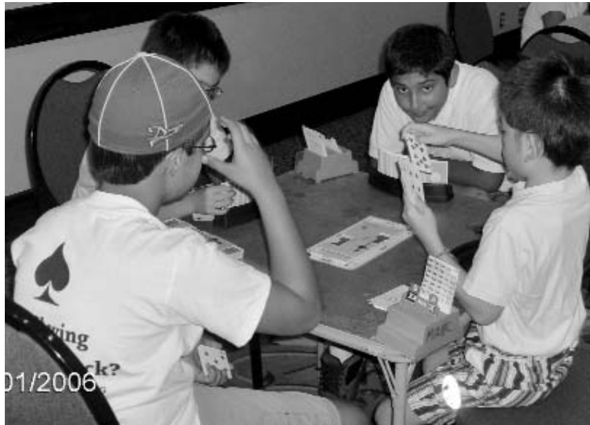
Youngsters enjoy a game of bridge as part of a lesson.

The AJB group is trying to recruit more teachers. They are sponsoring a Teacher Accreditation Program (TAP) in January. Support from Unit 114 and the Duplicate Bridge Association